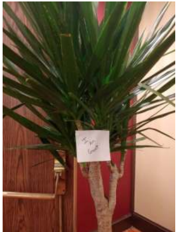
A little cosplay humor at SBI- "I am Groot"

If you are interested in the editor position, apply by January 1 st , 2020 to COC@sfcq1.com (ADM. Ed Ciccarone) with details your abilities and capabilities.