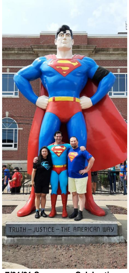
7/31/21 Superman Celebration