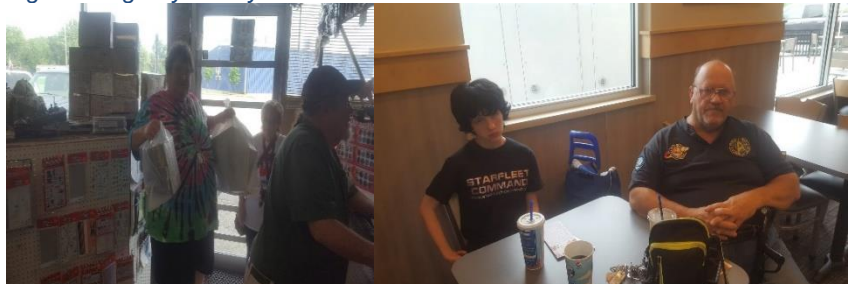
Figure 5Big Boy Hobby