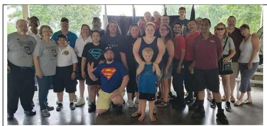
7/31/21 picnic with Starfleet International