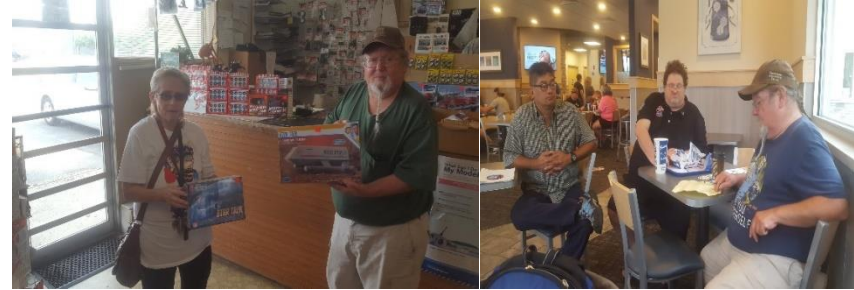
Figure 3July Meeting