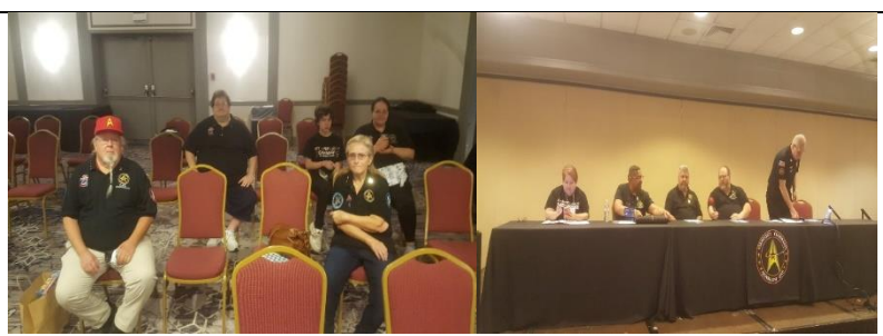
Figure 1 SFC Mid-Year meeting