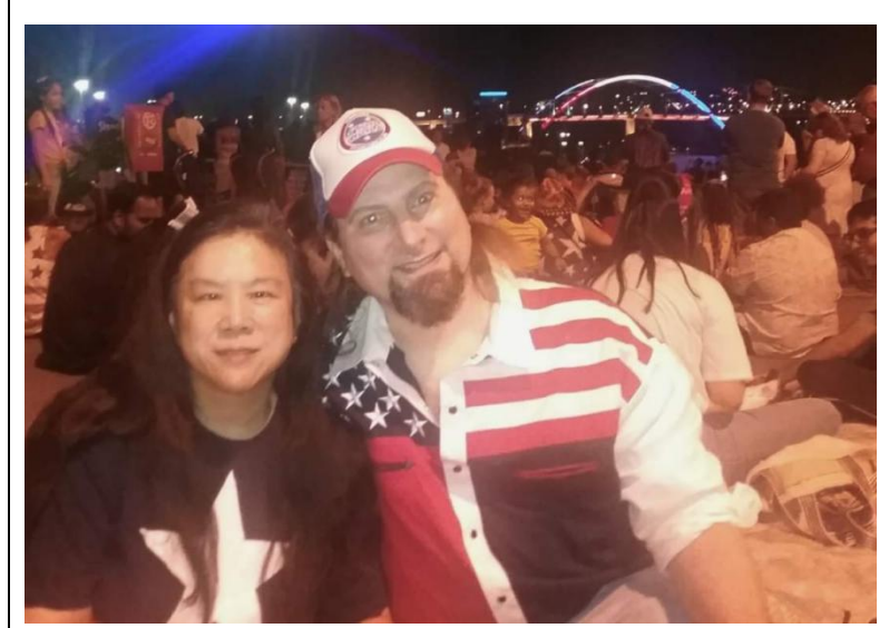
7/4/21 at Fireworks in Nashville