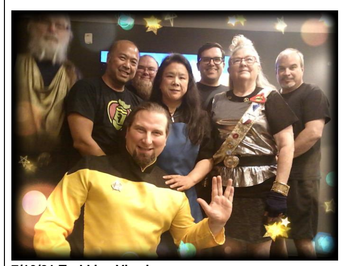
7/10/21 Trekkies Viewing