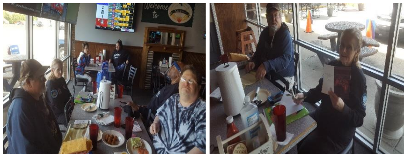
May Meeting & Birthday

USE THIS SECTION FOR PHOTOS OF MEETINGS, AWAY MISSIONS, ETC. PLEASE LABEL WITH TIME, PLACE, AND IDENTIFYING CAPTION.