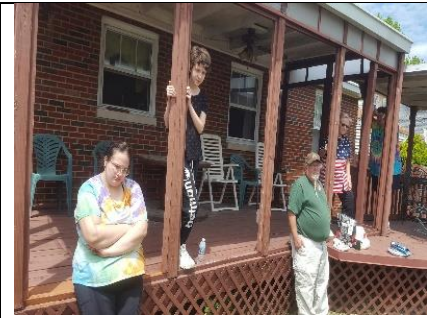
Memorial Day Cookout