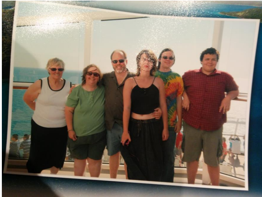
Aboard the Good Ship Celebrity Reflection, Rome, Italy!