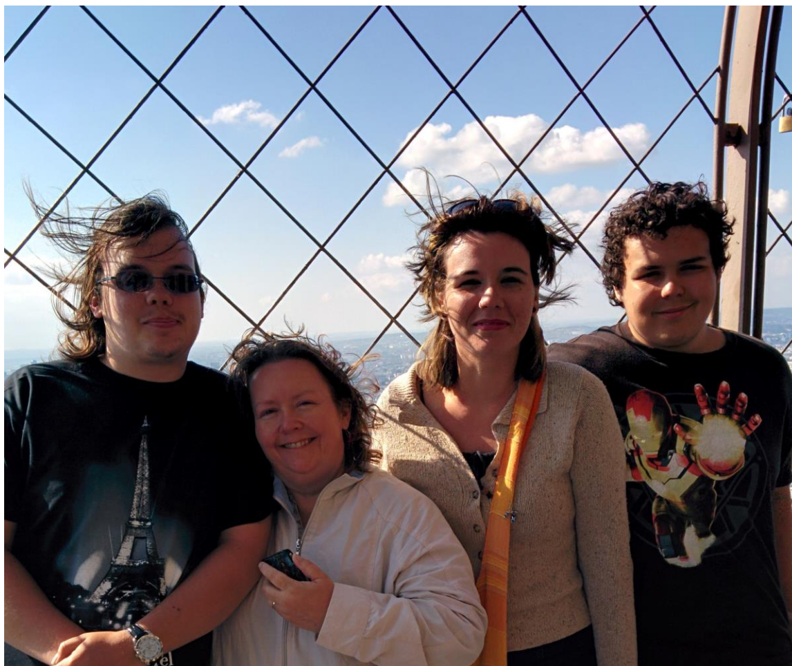
Atop the Tour Eiffel, Paris, France - it was a wee bit chilly (and windy!) all the way up there. You can definitely see that I'm vertically challenged here!